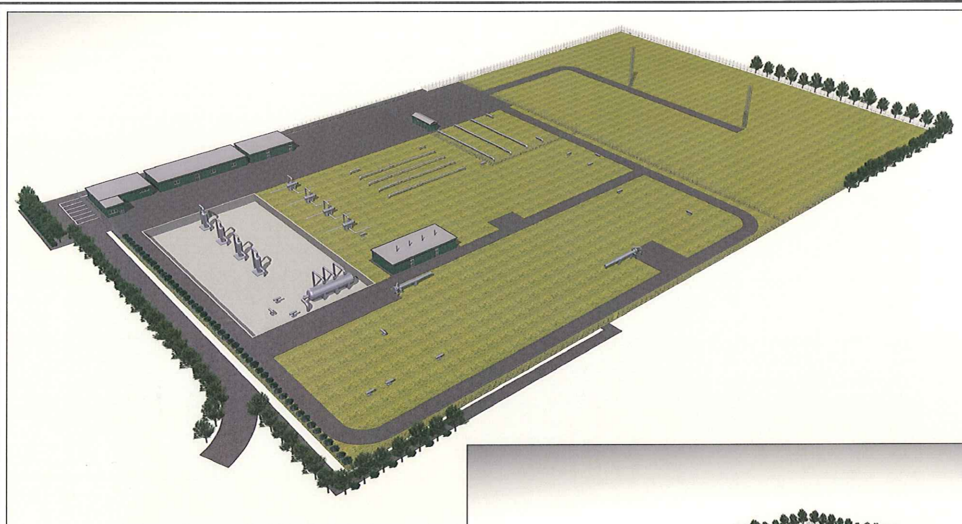
VISTA TRIDIMENSIONALE 1