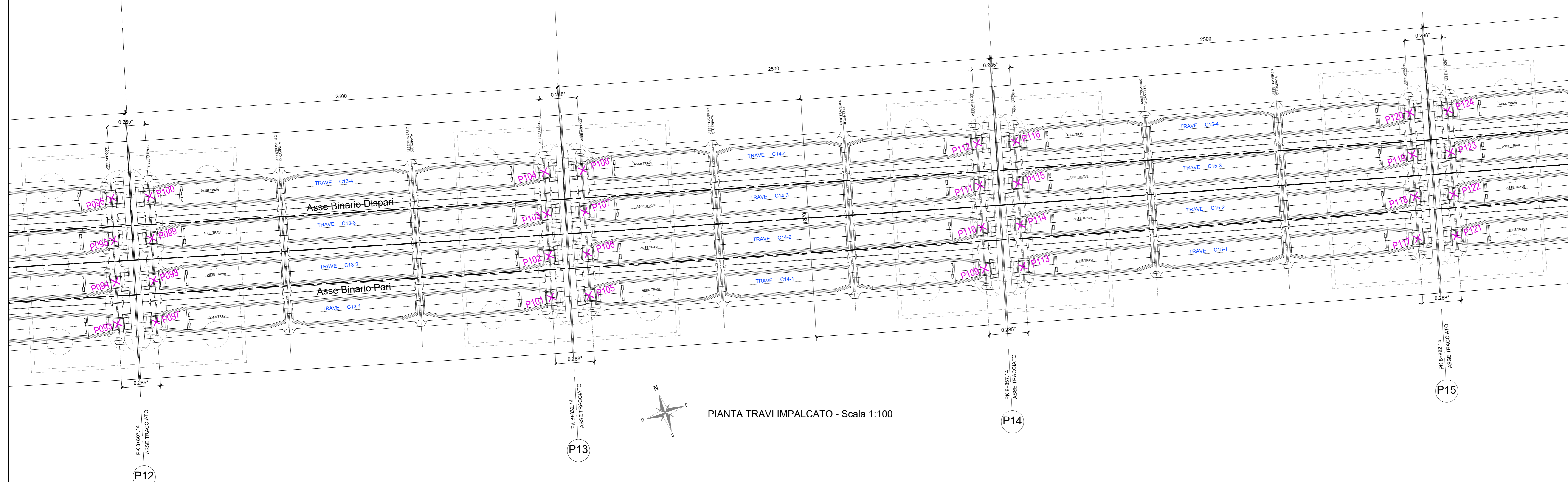
PIANTA TRAVI IMPALCATO - Scala 1:100