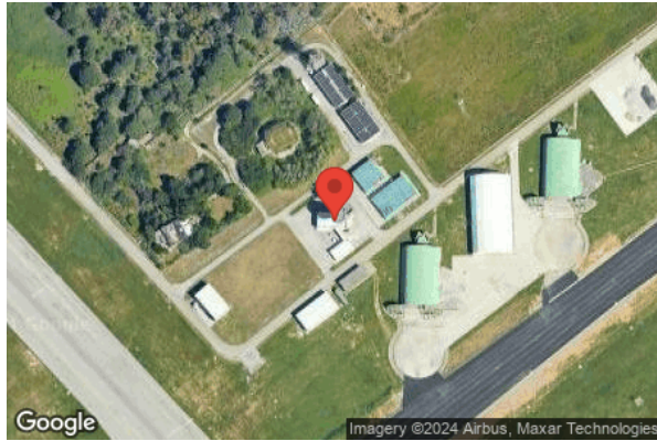
Map image of 1-ATCT