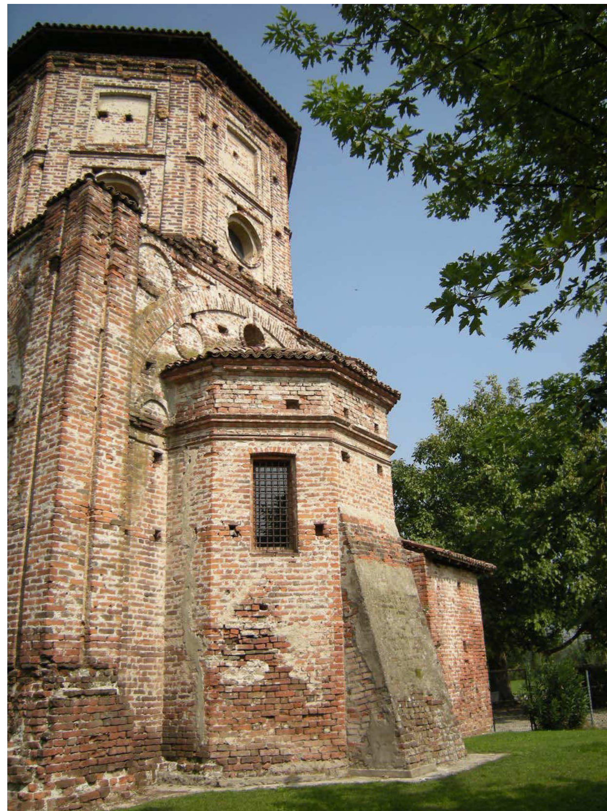
11-(Varie) Rossate particolare