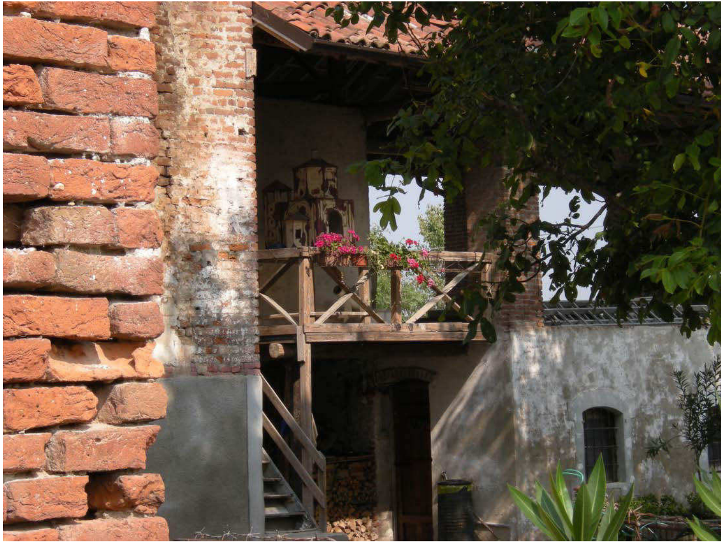
11-(Varie) Rossate particolare