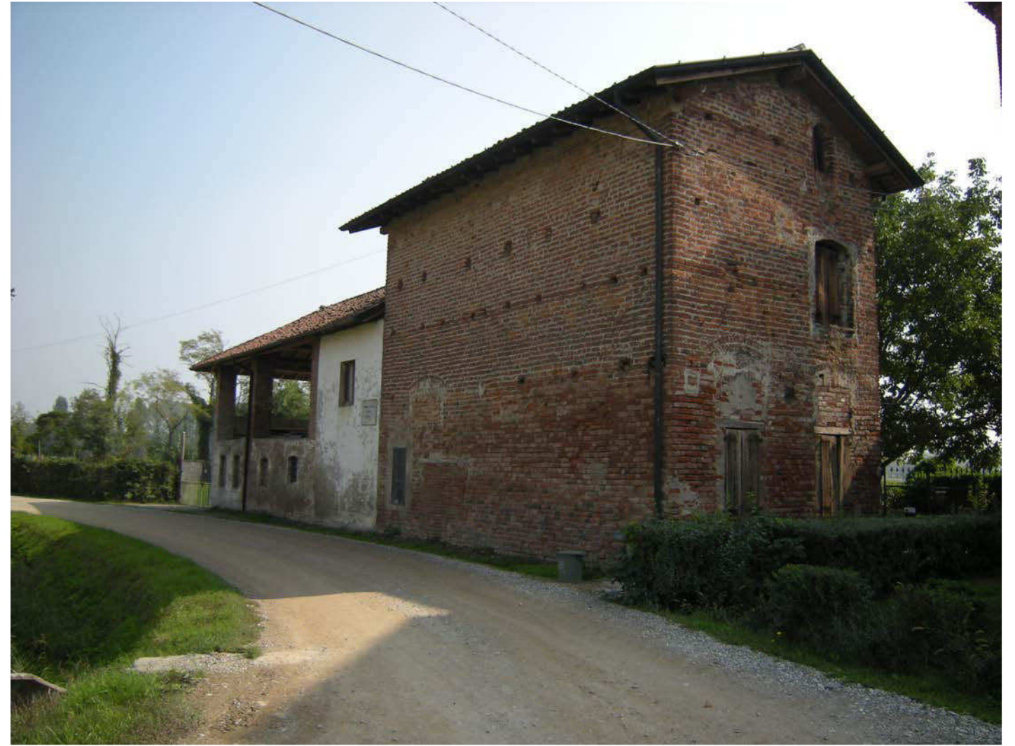
11-(Varie) Rossate particolare