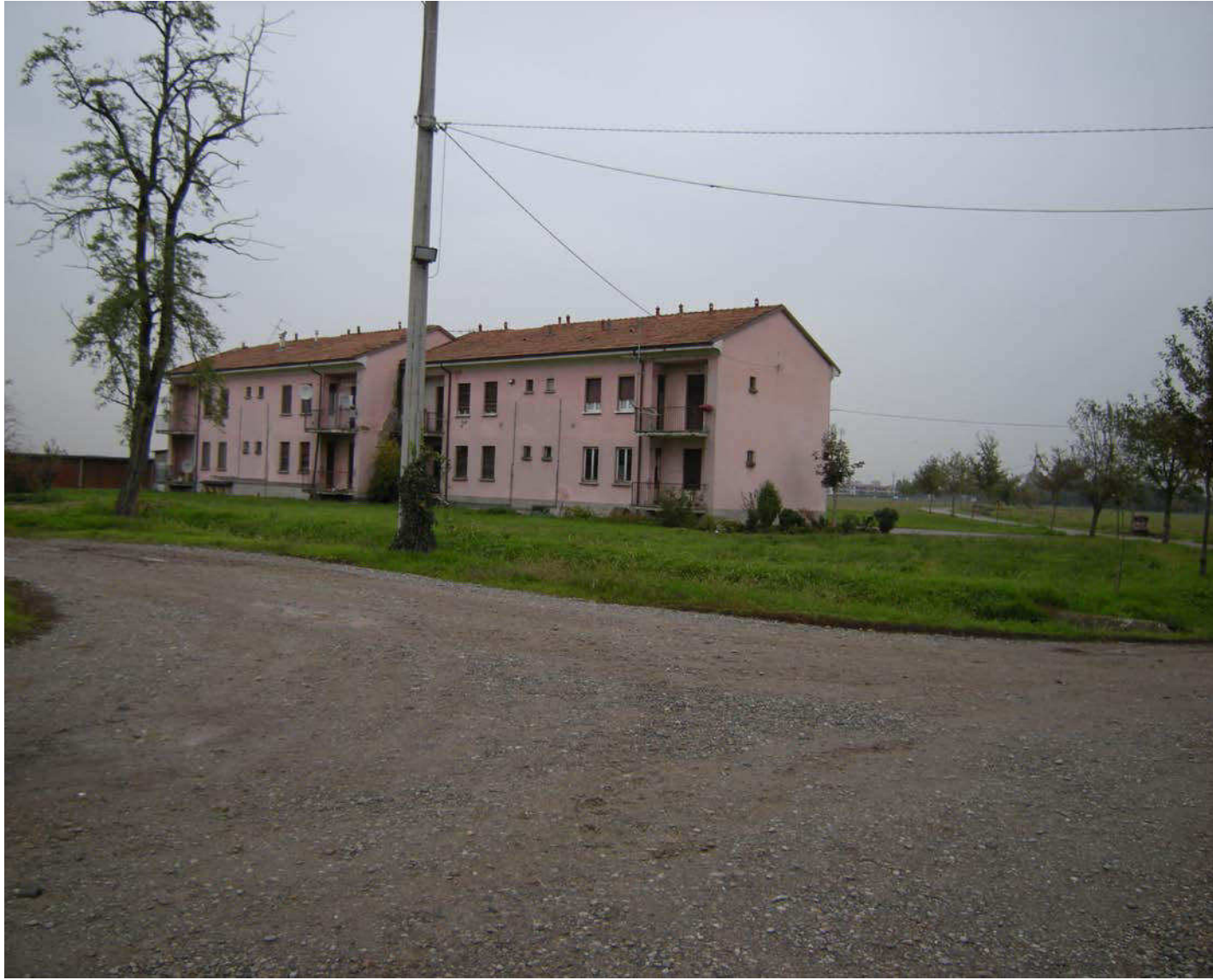
11-(Varie) Rossate particolare