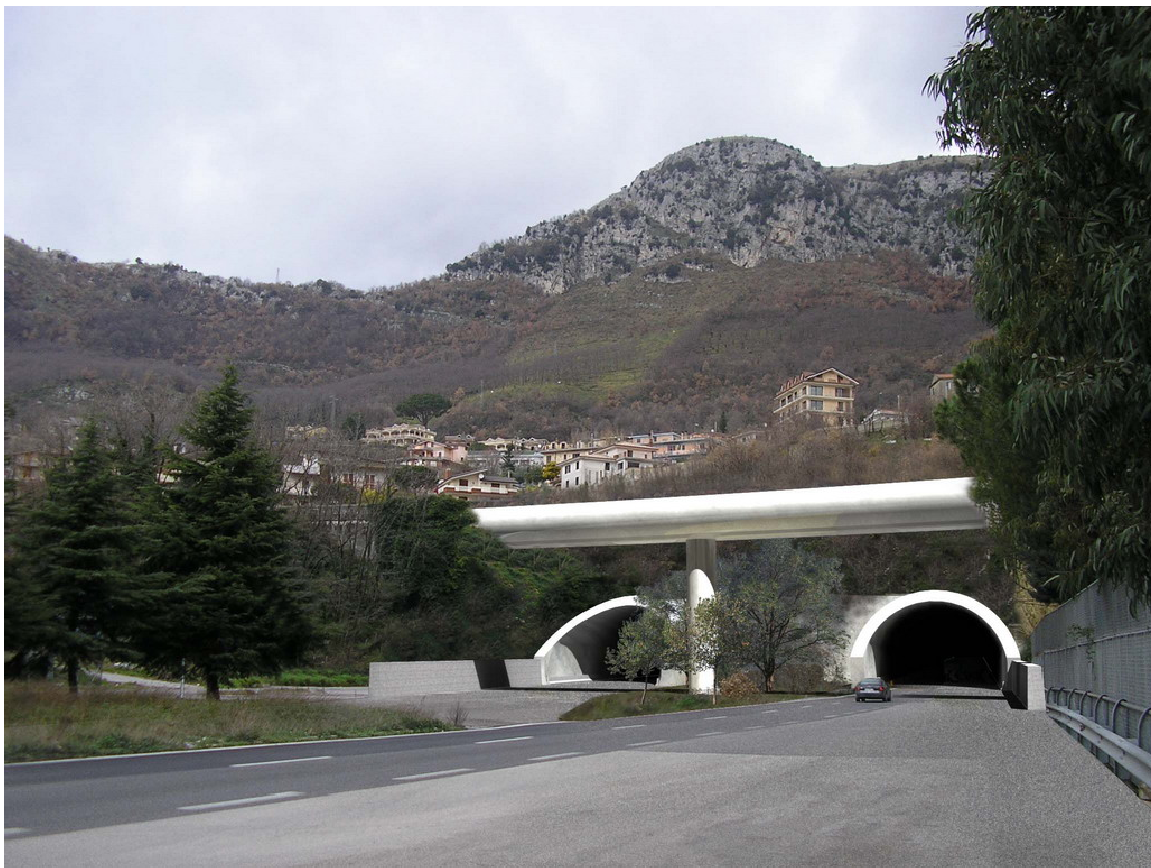
FOTO 4 POST OPERAM