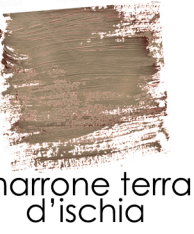
marrone terra d'ischia