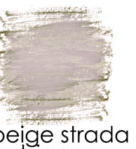
beige strada bianca