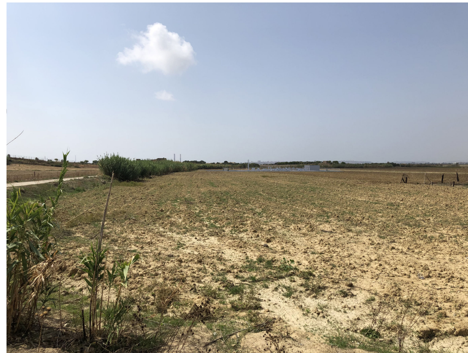
Post operam - senza mitigazioni / without mitigations