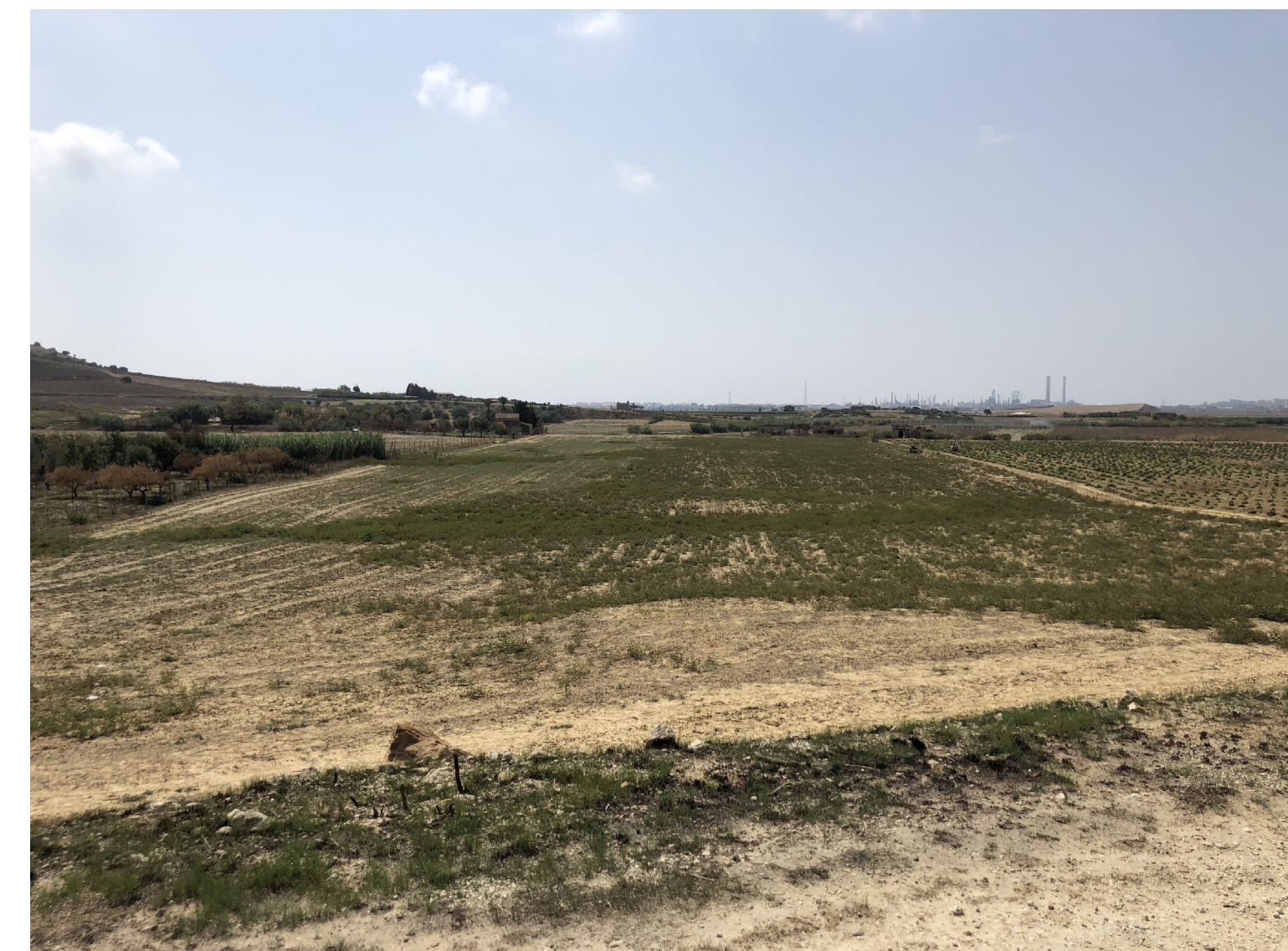
Post operam - con mitigazioni* / with mitigations*