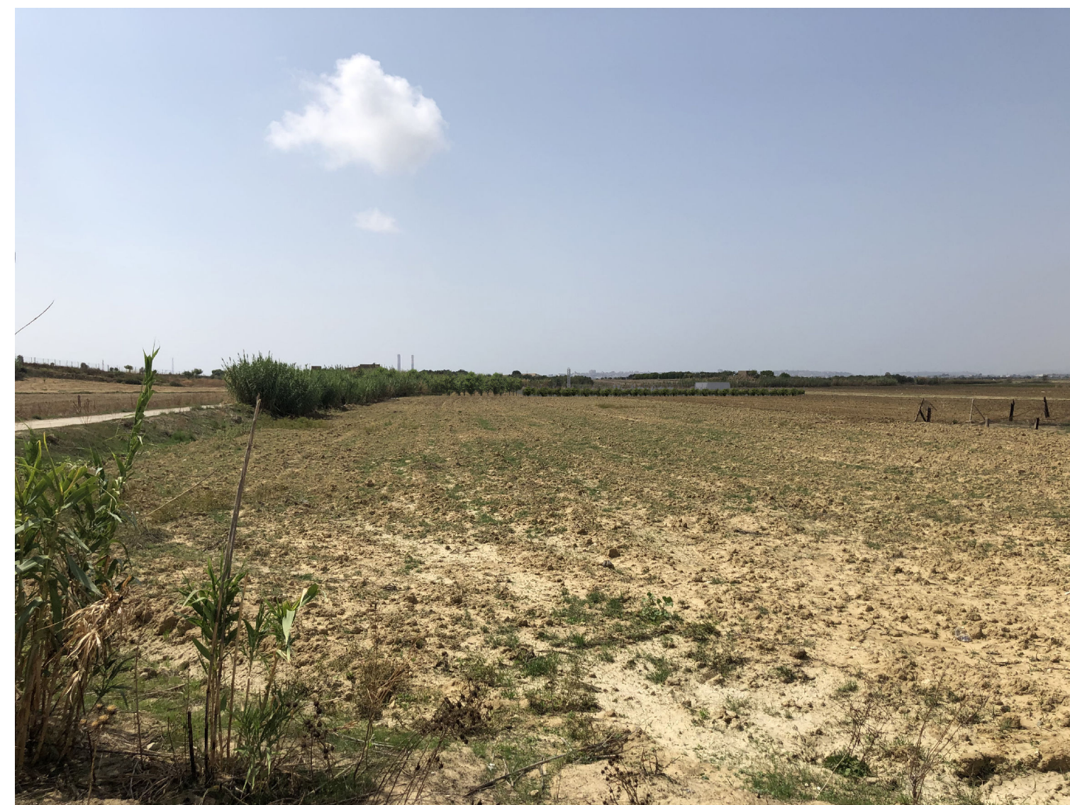
Post operam - con mitigazioni* / with mitigations*