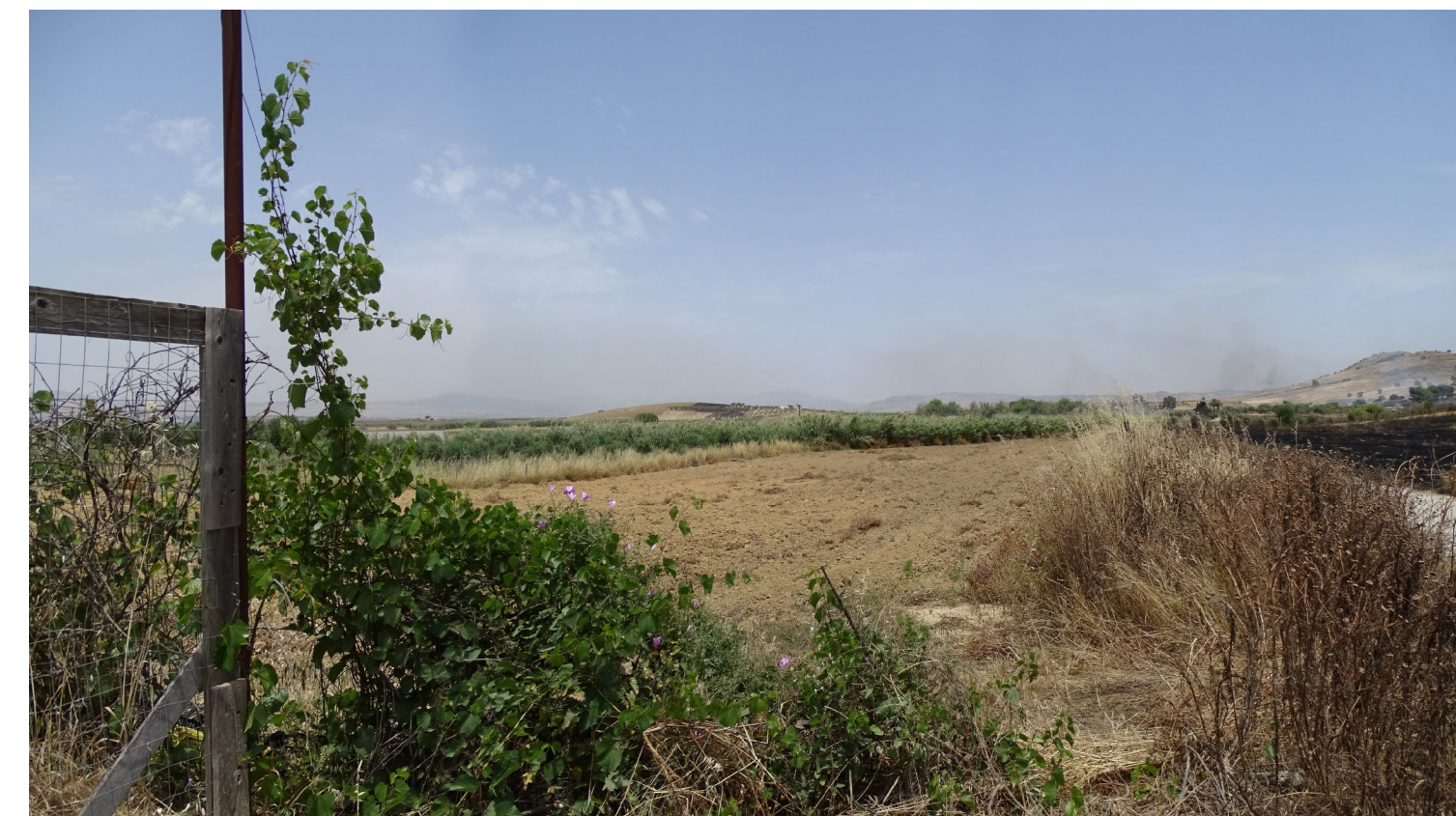
Post operam - con mitigazioni* / with mitigations*