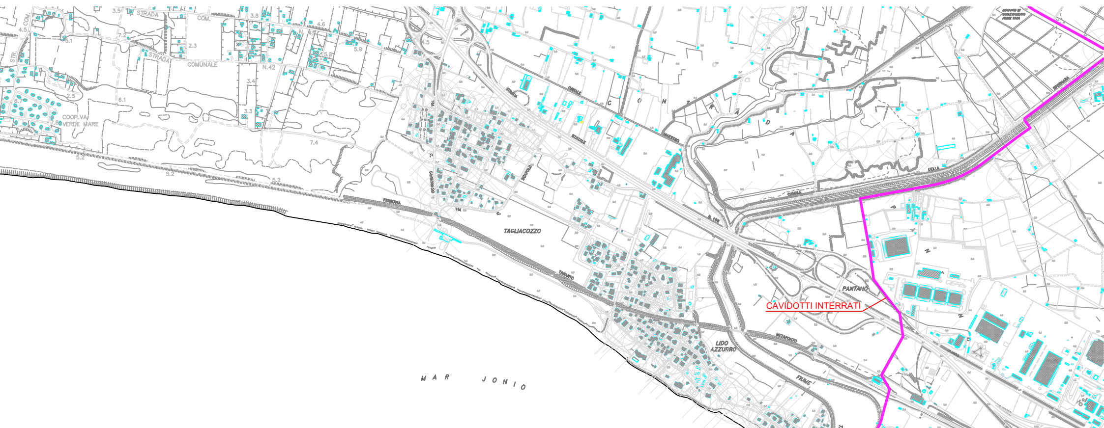
COORDINATE AREE DI CANTIERE GAUSS-BOAGA (FUSO EST)