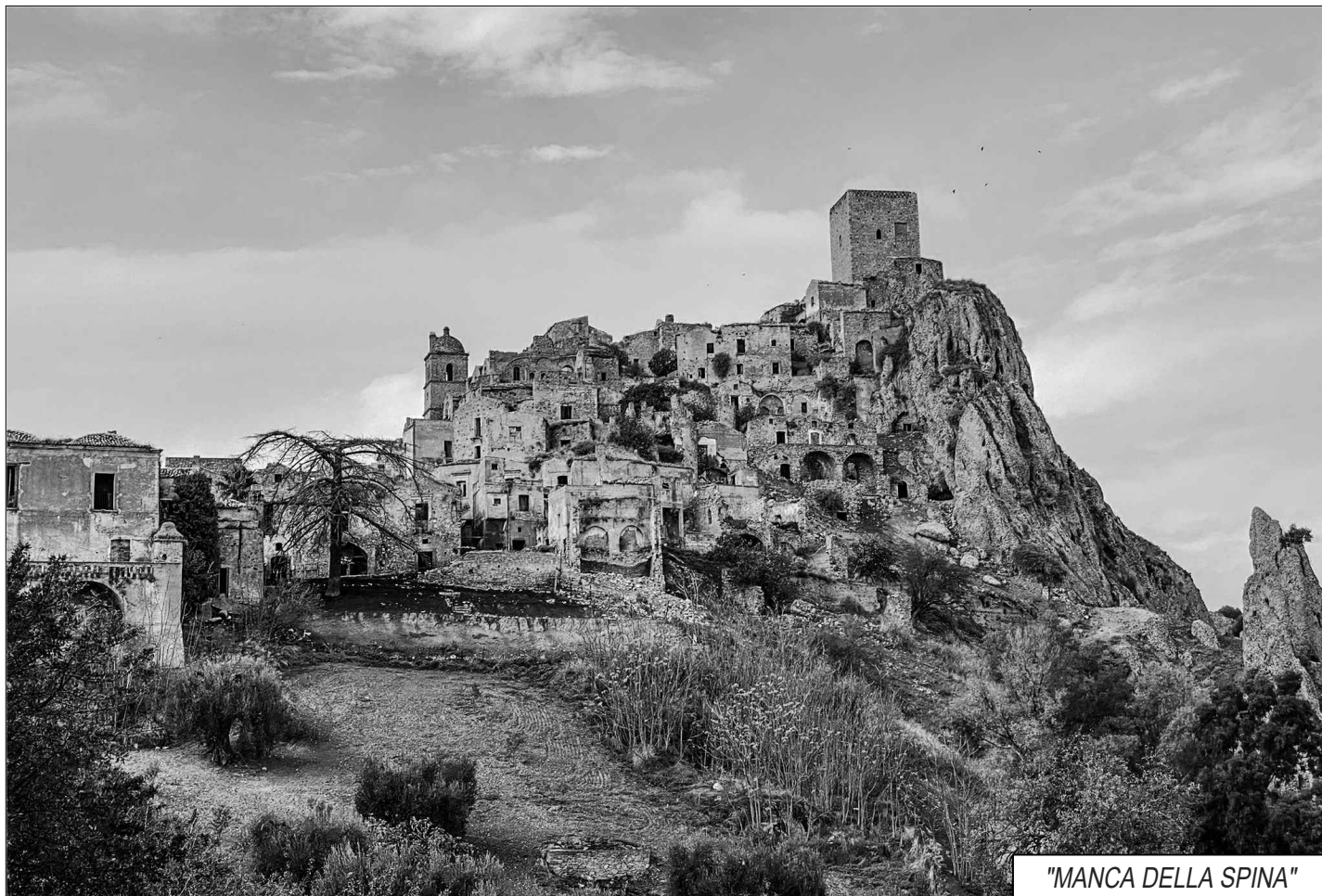
"MANCA DELLA SPINA"