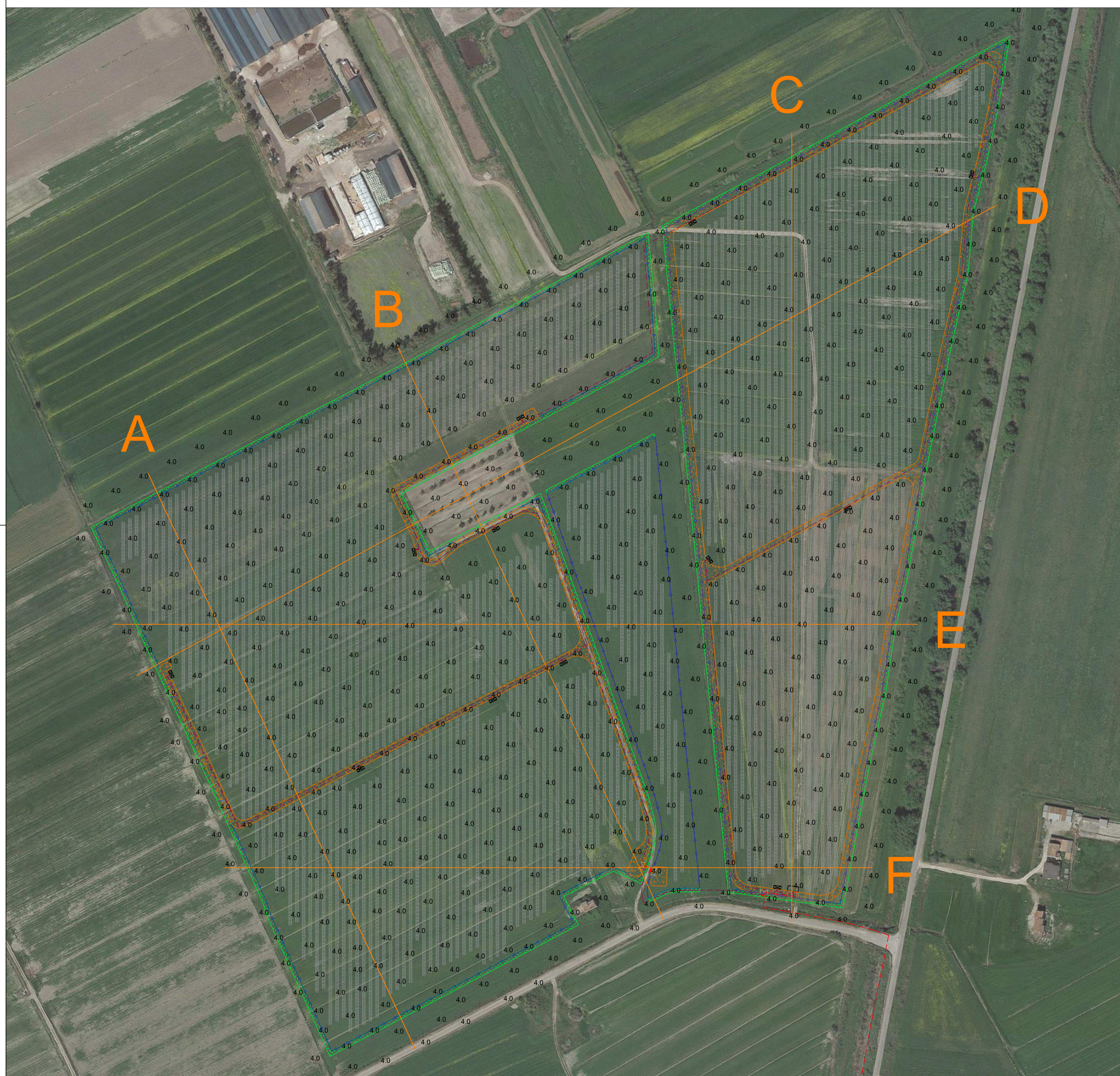
Planimetria Scala 1:2000