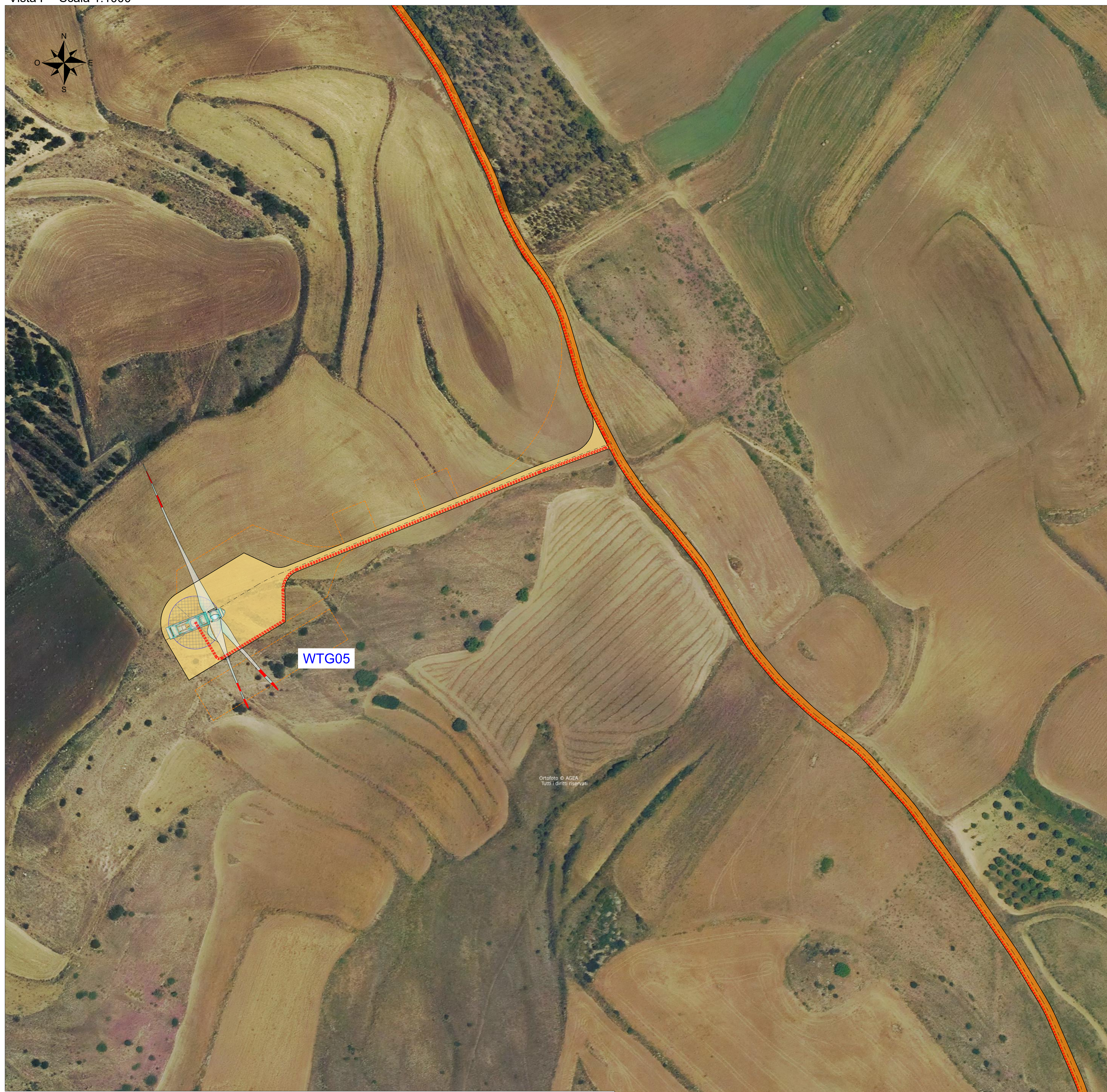
Inquadramento generale - Scala 1:25000