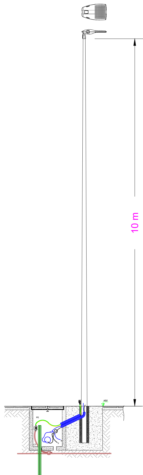
Particolare illuminazione stradale h=10m - Scala 1:50