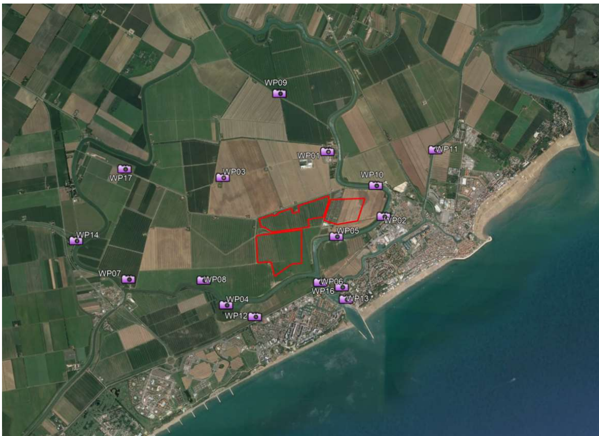
Figura 1 - Aereofoto con indicazione dei punti di vista.